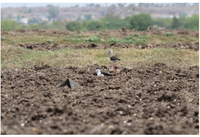
35. Parent Black-winged Stilt incubating.

[35]. We could only observe the same nest the next day for about 15 min and found no change in egg composition and number. The Black-winged Stilt pair was found to incubate the nest.