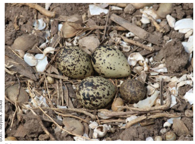
\textbf{34.} \ \textbf{Black-winged Stilt nest with an egg of Oriental Pratincole}.

On 6 June 2022, at 1006 h, while returning after bird watching at Bhigwan, Pune (18.28°N, 74.77°E), we came across a nest with three Black-winged Stilt Himantopus himantopus and one Oriental Pratincole Glareola maldivarum egg [34]. The nest was located in an unused agricultural field. The nest was a shallow mud scrape made up of shell fragments, twigs, and agricultural stubble. The Black-winged Stilt eggs were cream-coloured with black and brown spots, whereas the Oriental Pratincole egg was relatively smaller in size with black-brown blotches on a pale brown base.